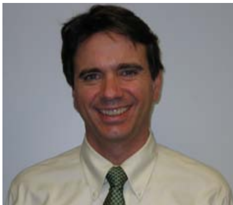
Dr. Marcus Plescia

This fall there have been important changes proposed by the U.S. Preventive Services Task Force (USPSTF) related to its recommendations for prostate and cervical cancer screening. These draft recommendations were open for public comment until November. Following consideration of comments, the task force will finalize new recommendations.